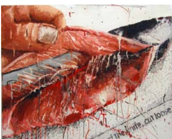
MARILYN MINTER Food Porn #69 (thirty five) 1990 enamel on metal sign 24 x 30 inches