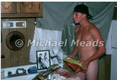
MICHAEL MEADS Depression Ham I 1994 c-print 8 x 10 inches edition 4/10