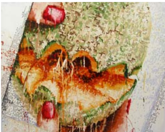
MARILYN MINTER 100 Food Porn #58 (cantaloupe) 1990 enamel on metal sign 24 x 30 inches