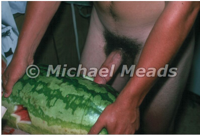
MICHAEL MEADS Depression Ham II 1994 c-print 8 x 10 inches edition 4/10