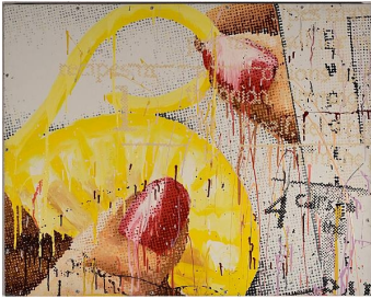
MARILYN MINTER 100 Food Porn #39 (lemon) 1990 enamel on metal sign 24 x 30 inches