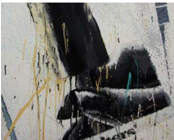
MARILYN MINTER Food Porn #69 (popsicle) 1990 enamel on metal sign 24 x 30 inches