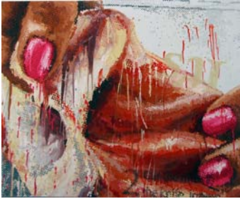
MARILYN MINTER 100 Food Porn #69 (chicken) 1990 enamel on metal sign 24 x 30 inches