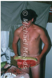
MICHAEL MEADS Depression Ham IV 1994 c-print 8 x 10 inches edition 4/10