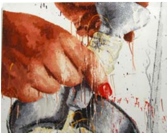
MARILYN MINTER 100 Food Porn #51 (sausage casing) 1990 enamel on metal sign 24 x 30 inches