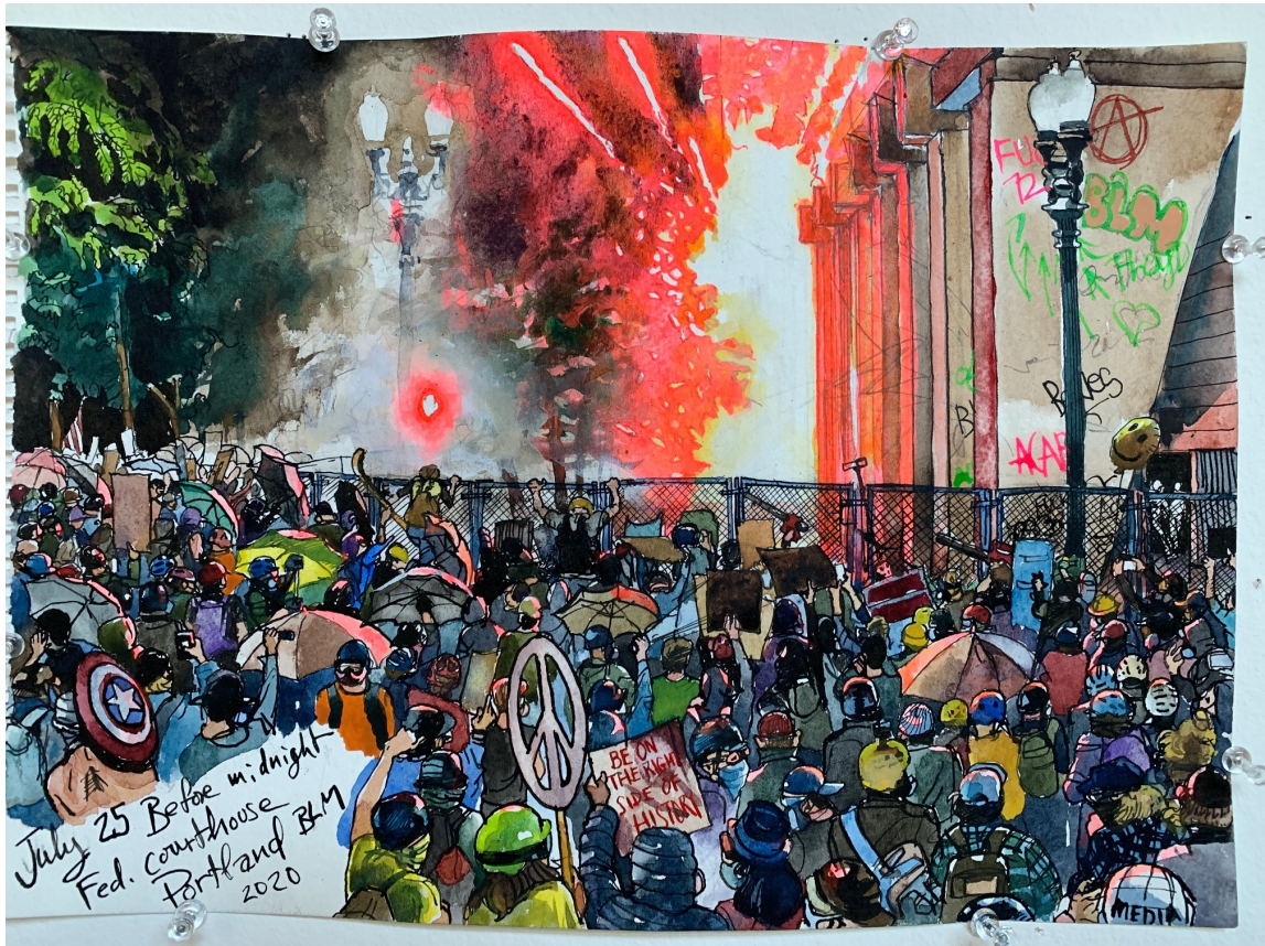
Steve Mumford, July 25 Before midnight Fed. courthouse, Portland BLM , 2020, 2020 watercolor and ink on paper

Postmasters presents a wide selection of drawings by Steve Mumford depicting the Covid-19 crisis in NYC, the Black Lives Matter protests in NYC and Portland, Oregon, and campaign rallies for Donald Trump in Portland, Maine and Fredricksburg, Virginia in 2016.