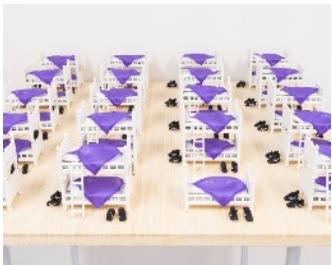
In the Future the Past Will be Different (part 2), 2016

In this "soothing desk fountain," the piece miniaturizes the controversial Julian Assange, relying on lifestyle magazine visits to depict his office in the Ecuadorian Embassy in London. The "office" is paired with a famous Russian fountain of Peterhof palace, referencing the debated Russian influence in the 2016 American election and Assange's Wikileaks. The miniature piece also poses as a "soothing desk fountain", pairing questionable actions with a contrasting base reflective of the push and pull in contemporary political turmoil and everyday mundane life.