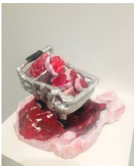
Sharper Image Steak Sale, 2018

On January 6, 2016, Ammon Bundy along with other men and women with multiple firearms occupied the Malheur Wildlife Refuge Center, claiming federal land should be turned over to the states. The men refused to stand down and release their weapons to the authorities until they finally began to surrender themselves on Feb 11, after an arrest led to the death of one its members as he was reaching for his handgun. When the members made pleas on the internet for "supplies and care packages" people began anonymously sending the members boxes of sex toys and dildo's, which Ammon declared in a follow up video to be hate mail.