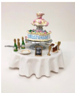
Congrats!! (Operations Crossroads), 2018

This piece re-imagines the real-life last meal of the cult Heaven's Gate, of whose 39 members ordered the identical meal of Turkey Pot Pie, side salad, and iced tea with lemon at the chain restaurant Marie Callender's as a last meal before committing group suicide. The last supper has always been a richly loaded meal used throughout history to memorialize important events, and this piece marks the occasion of the religious cult's last meal, before their death/desired ascension, in an American chain restaurant.