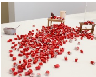
909 Solo Cups, 2017

On March 8, 2016, Donald Trump sat in front of a beautiful pile of vacuum sealed steaks at a news conference, declaring them to be Trump steaks. For a brief moment in time, Trump attempted, but failed to sell steaks on Sharper Image, and in fact, these steaks were imposters, not made by him. This inane, useless moment in time would disappear amongst the much larger and dangerous lies he would go on to tell, but here, it is forever memorialized.