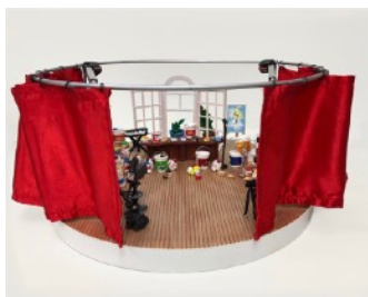
The Jim Bakker Show! (Time Has Come: How to Prepare Now for Epic Events Ahead), 2018