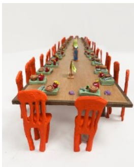
Turkey Pot Pie Special Only at Marie Callender's (The Last Supper), 2018