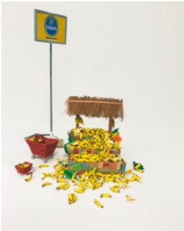
Bananas on sale! (Banana Massacre), 2018