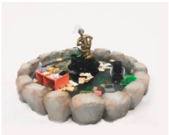
Soothing Desk Fountain II (Julian Assange's Desk in the Ecuadorian Embassy), 2018

This "soothing desk fountain" alludes to the last meal of the Movement for the Restoration of the Ten Commandments of God, a cult that led to the deaths (suicide and murder) of 924 of the cult's members and non-members. The night before the tragedy, a huge and festive party of slaughtered cows and sodas served as their last meal. The desk fountain, traditionally used as a tool for relaxation, is paired with this contradictory tragedy.