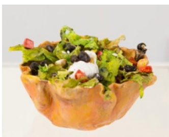
Happy # CincoDeMayo!, 2016

The 909 solo cups, at first glance, resemble a scene of a riotous frat party, but actually portrays the Jonestown massacre led by the charismatic cult leader Jim Jones. The 909 cups found at Jonestown, containing kool-aid spiked with poison, was the horrific final scene of a utopian religious community that moved to the jungle in Guyana.