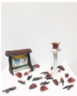
Special Delivery (Citizens for Constitutional Freedom), 2018