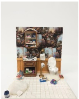
Child's Dollhouse #infowars (Alex Jones' Bathroom), 2018

This miniature piece alludes to both a charming banana stand found on the side of the road as well as a grocery store display that could be found in Target, promoting the exceptionally cheap and popular fruit in the United States. The bananas, branded as Chiquita, which originated from the company United Fruit, represent a long and violent past of the company's practices including ousting democratically elected Jacobo Arbenz Guzmán of Guatemala, creating banana republics, using environmentally degrading practices, and the killing of thousands of striking laborers protesting unfair working environments in the Banana Massacre. The piece contains 347 bananas, each representing a family who recently sued Chiquita in 2007 for funding a terrorist organization that killed their family members, to which Chiquita pled guilty. The piece, tropical and inviting, alludes to the darker history of how we are so easily able to buy this fruit.