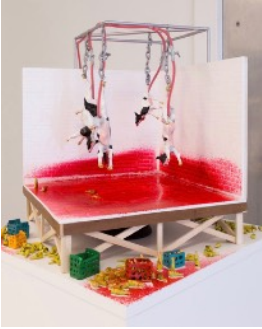
Soothing Desk Fountain I (The Last Meal for the Movement of the Restoration of Ten Commandments of God), 2018